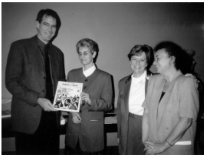
Donation Ceremony - Budapest Municipal Library

As part of its concerts and educational activities, American Voices is continuing with its donations of basic collections of American